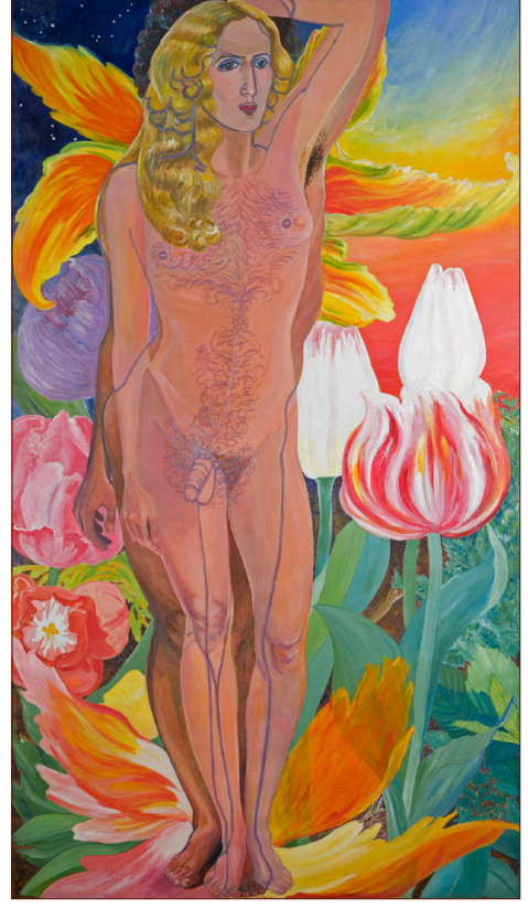
Lilith, 1976 Sylvia Sleigh (1916–2010), acrylic on canvas 108 1/8 x 60 in. Rowan University Art Gallery, Sylvia Sleigh Collection (2011.105)

This course is designed for students with all levels of familiarity with the Bible, from years of study to never having opened one before. Topics of discussion include prohibited and mandated sexual practices, sex work, celibacy, motherhood, and queerness. This course covers both the historical contexts in which these texts were written and the modern legacies of these ideas. Texts and discussions evaluate the diversity of biblical perspectives on various topics relating to sex, sexuality, gender, bodies, family, crime, and society. The final paper in the course involves comparing one of the biblical texts discussed in the class with a pop-culture text of the student's choosing, not only analyzing how these ancient texts continue to influence modern works but also gaining a new interpretive perspective through which to reconsider the Bible itself.