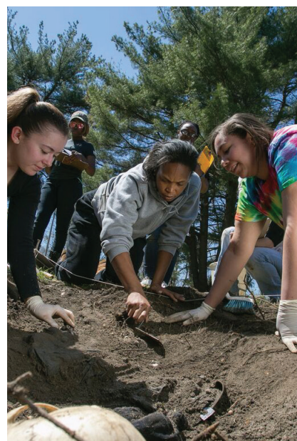
Anthropology students uncover human remains during a mock-excavation.

The College has entered into Law & Justice Studies partnerships with Rowan College at Gloucester County and Rowan College at Burlington County.