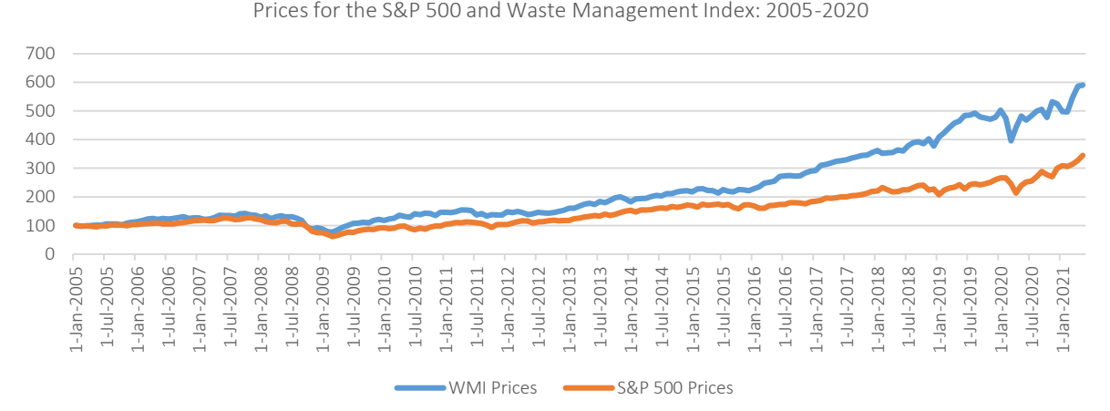
Figure 3. Price volatility for waste management stocks and the S&P500

for recycled paper than new paper and more than 7 times larger for recycled glass than new glass. Academic research consistently shows that introducing derivatives reduces price volatility in the underlying asset, as described in the Literature Review section of this paper. Therefore, listing exchange-traded futures in recycled PCM products would likely lead to lower volatility in recycled PCM prices, making recycled PCM relatively less unattractive than new material to end users.