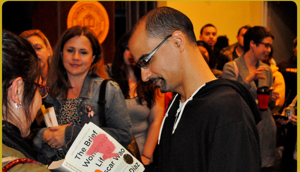
Distinguished speaker and Pulitzer Prize-winning author, Junot Diaz, signs his book to a delighted crowd of faculty and students.