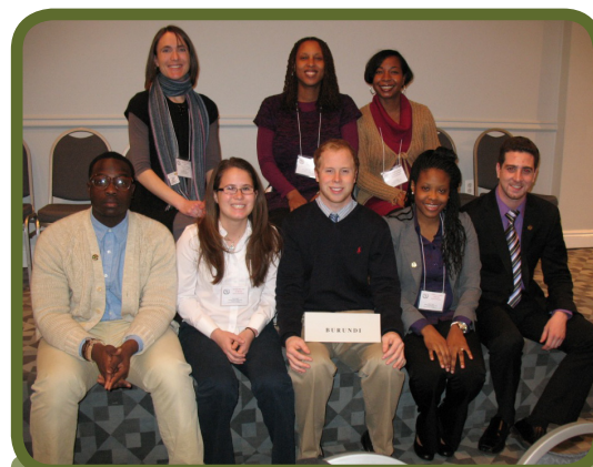
History students attend their first debate held at Howard University